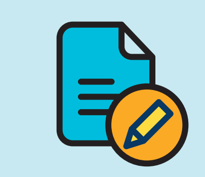
Note the word count.

You can work on the form section by section, and "save as you go" until you are ready to submit your application. (It's not something you fill out and complete in one go.)