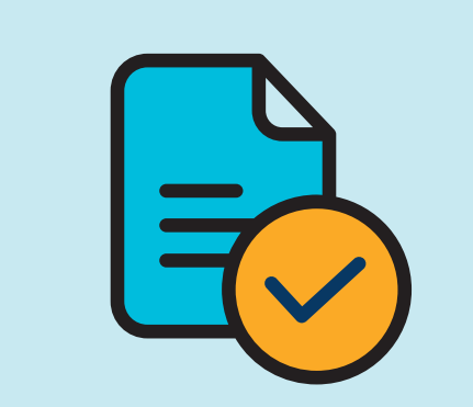
Double check accuracy of information.

Your response to some questions has a corresponding word count.